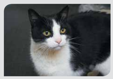
Blackie - latest resident of Tui Wing